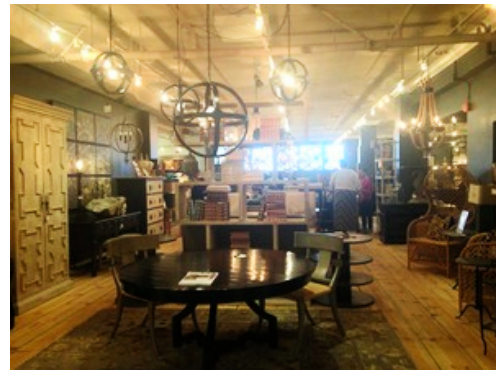
SDSA NY Strickland Event NEWEL ART GALLERIES