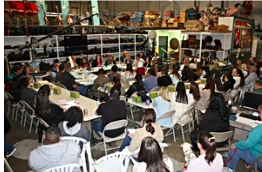
JULY General Membership Meeting MODERNICA